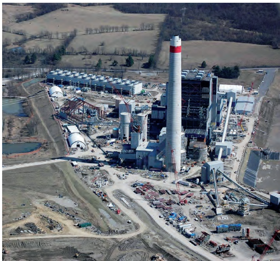
The 696MW Longview power plant, situated in Madsville, West Virginia makes extensive use of an on-line coal analyser in order to insure that blending operations are as effective as possible.